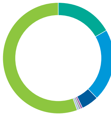
THE COMPANY'S PROCUREMENT STRUCTURE BY ACTIVITIES (RUB MN)